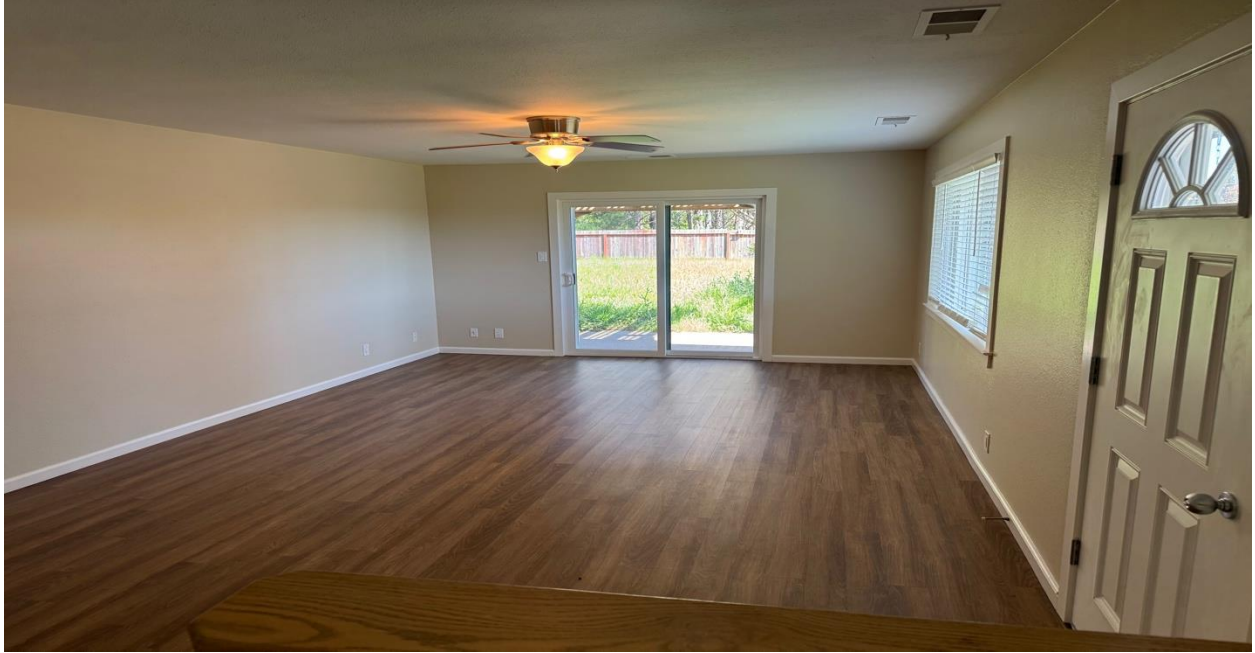
Living room view