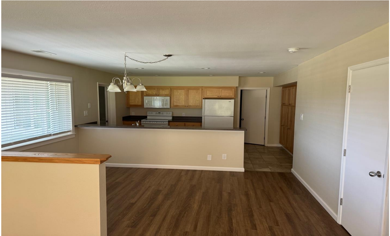
Kitchen view ( Laundry and storage room is right of kitchen)